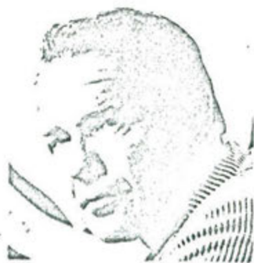
ROBERT H. FINCH

Robert Finch received his B.A. degree in political science from Occidental College and earned his law degree at the University of Southern California Law